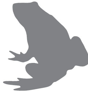
Bullfrog (3½-8 in.)