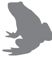
Southern Leopard Frog (2-3½ in.)